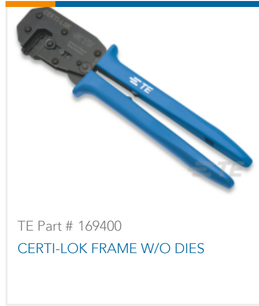
TE Part # 169400 CERTI-LOK FRAME W/O DIES