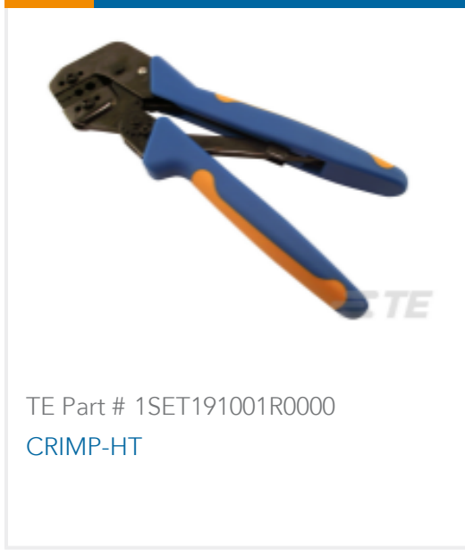
TE Part # 1SET191001R0000 CRIMP-HT