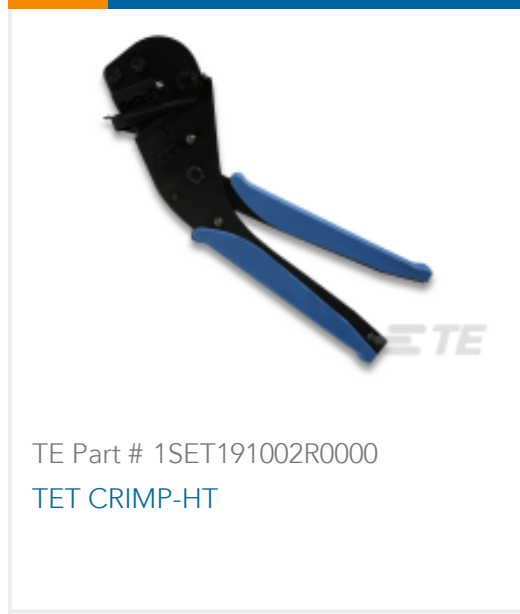
TE Part # 1SET191002R0000 TET CRIMP-HT