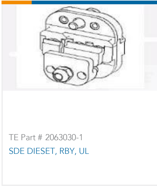
TE Part # 2063030-1 SDE DIESET, RBY, UL