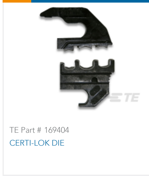
TE Part # 169404 CERTI-LOK DIE