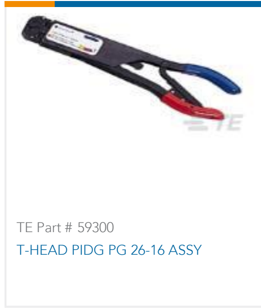
TE Part # 59300 T-HEAD PIDG PG 26-16 ASSY