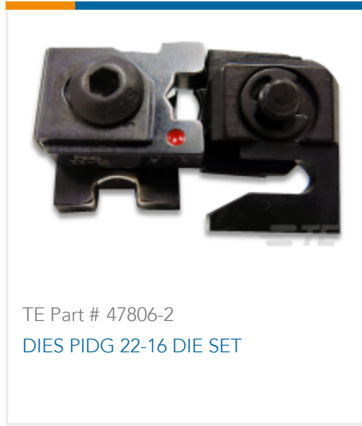
TE Part # 47806-2 DIES PIDG 22-16 DIE SET